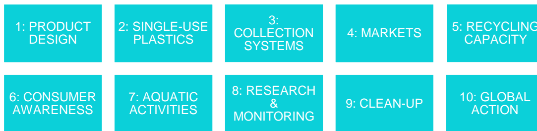
Figure 3. Priority result areas for a Canada-wide approach to zero plastic waste

analysis. These ten results areas will drive the development of future actions and orient collective efforts to achieve zero plastic waste.