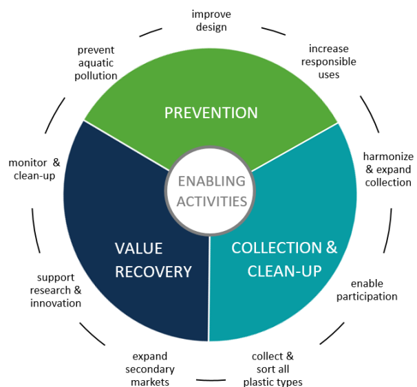
Figure 1: Main areas of action for a circular plastics economy in Canada

As illustrated, the Strategy recognises the interdependence of three areas of activity as elements of an integrated system: prevention, collection and clean-up, and value recovery. The system's performance must be supported and improved by a wide range of enabling activities such as consumer education, research, regulations and market-based instruments in order to achieve the zero plastic waste goal. Innovation throughout the plastic lifecycle – from design to collection and value recovery – will be essential to capture the economic, social and environmental benefits of zero plastic waste.